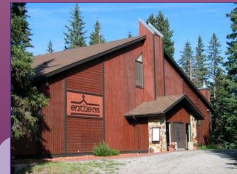
ENTHEOS RETREAT CENTRE Calgary, Alberta, Canada

"This has been the most precious time of my life! I came here to learn, but what I have also received from God in a personal way is beyond anything I could have wished!"